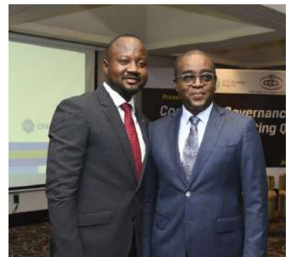
The conference was sponsored by Citi, Coronation Merchant Bank and Synergy Capital Managers.